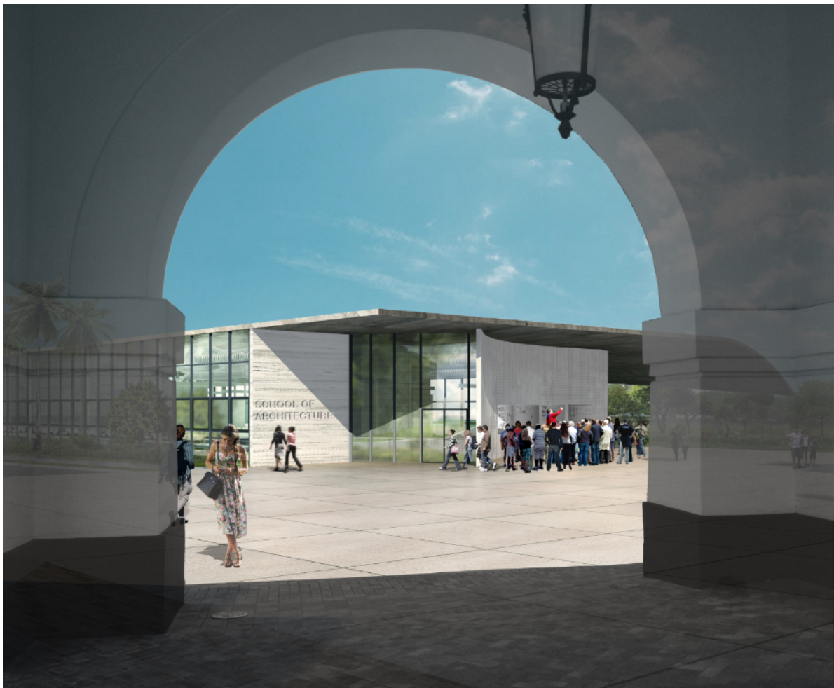
View from existing Jorge M. Perez Architecture Building towards the Murphy Design Studio Building